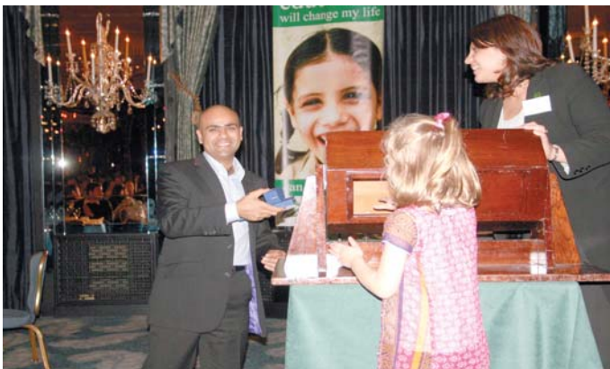
FTCF fund raiser