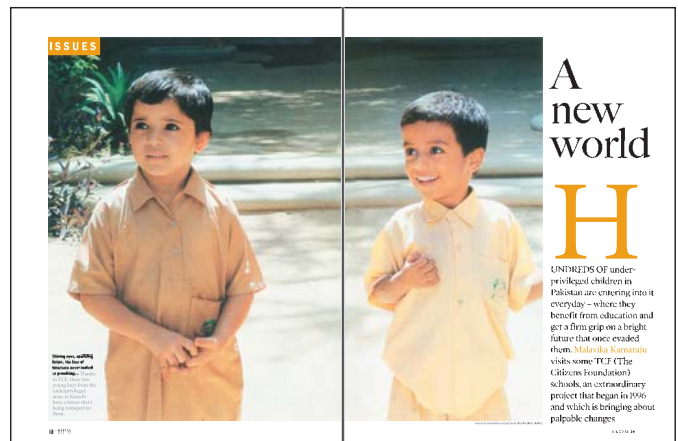
Friday Magazine Article

We are very grateful to TCF-UAE for arranging this opportunity. The article, which is available on our website, received great response from all over.