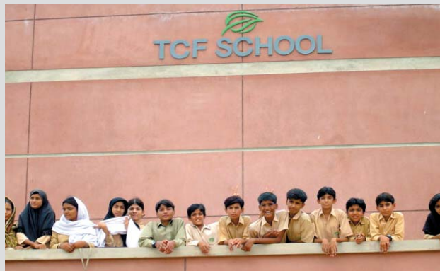
Enthusiastic participants of Summer School 2004

by a group of 30 dedicated volunteers teaching interesting courses such as English Conversation, Computers, Carpentry, Ceramics, Wall Painting, Professional Cooking, Beadwork and Waxwork.