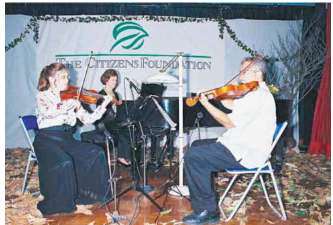
American artists perform at the STCF - Piano Recital