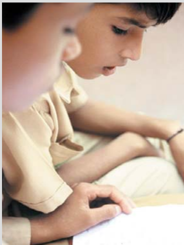
TCF children hard at work

Summer School 2004, a pilot project, was a four-week program from June 14 th to July 12 th 2004. It took place in 2 TCF school campuses in Bhattaiabad and Mauripur. Over 200 students from classes seventh, eighth, ninth and tenth attended the school with immense enthusiasm. The program was conducted