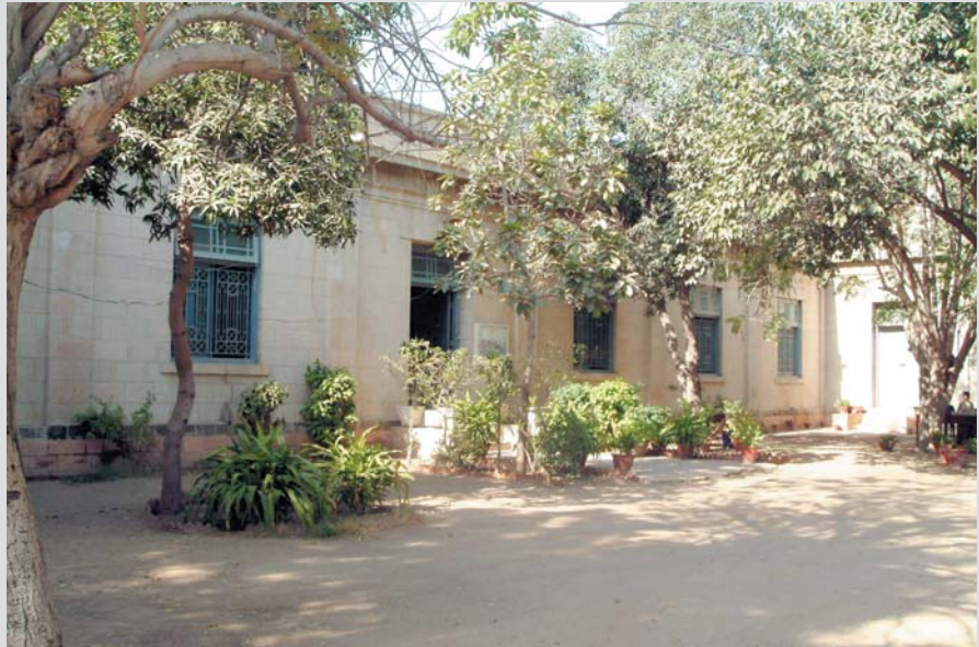
Teacher Training Centre in Karachi