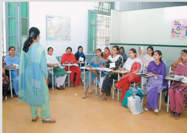
Teacher Training in progress

We received an overwhelming response from our principals and teachers who enthusiastically participated in the training programs.