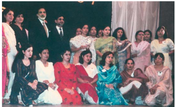
TCF Awards 2004 ceremony in Lahore

A major highlight of this function was the surprise appearance of Zia Mohyeddin, who delighted the audience with his recital of popular Urdu poetry and prose.