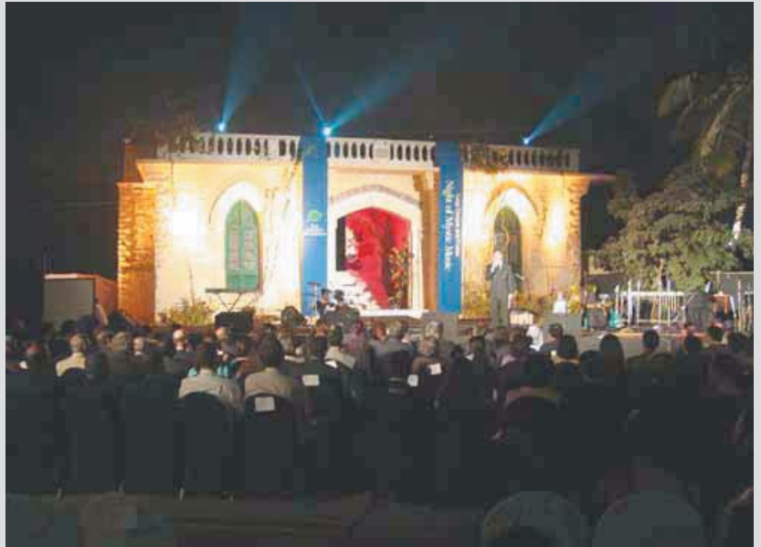
A treat for music enthusiasts