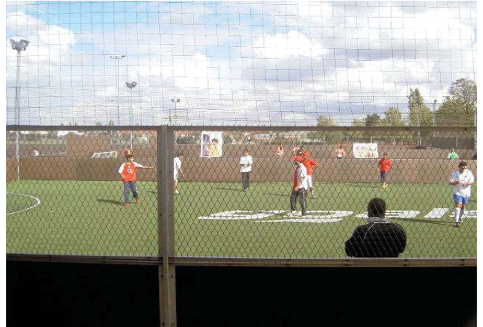
Football tournament at Wembley

F TCF were proud to show Pakistan's first and highly commended digital film " Raat Chali Hai Jhoom Ke " ( The Long Night ) in Glasgow, Newcastle and London. Over 400 people attended these viewings, which have received critical acclaim at various film festivals around the world.