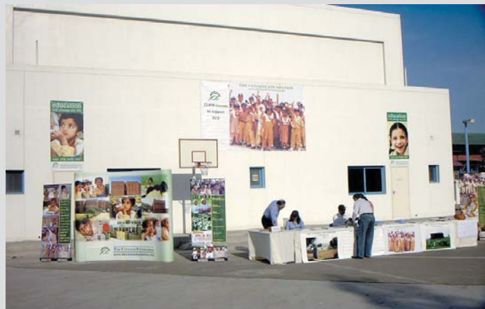
Emirates International School Day

Emirates International School organized a Charity Day garage sale on November 26, 2004 as part of its Awards Program. The program provides social and community service education to EIS students. Based on TCF's record and credibility, EIS, one of the UAE's most prominent schools, selected TCF as the sole beneficiary of the funds raised at the event. The Charity Day, which attracted over 2,000 visitors, proved an outstanding success.