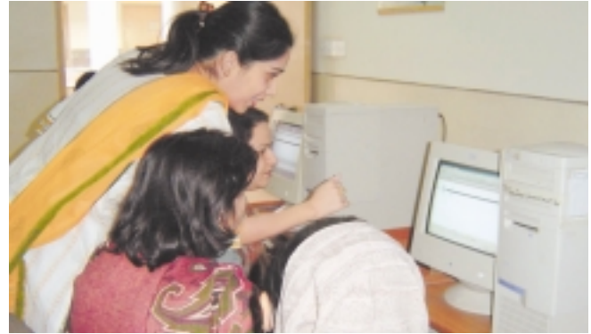
Training for tomorrow

Teacher training & development is an important element of the TCF education programme. Recognizing the significance of information technology, we organized a comprehensive computer training for our secondary school faculty, conducted with support from Unilever Pakistan, whose employees volunteered as trainers for the programme. The first training session was held from Jan 19 to Jan 26, 2004 in which 64 principals and teachers participated. The second session was held from April 19 to April 28, 2004 in which 74 more school staff was trained.