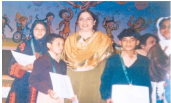
TCF children receive honours