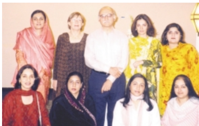
TCF family in Lahore