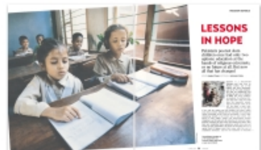
International recognition for TCF