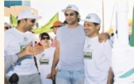
Sports icons show support