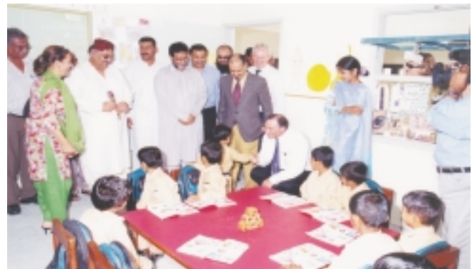
Our steps forward

A four- school unit Primary School Hubco-IPGD Campus Hub has recently been set up in the province of Baluchistan. This school has been sponsored by HUB Power Company along with International Power Global Development (IPGD), who are also funding the entire running costs of the school.