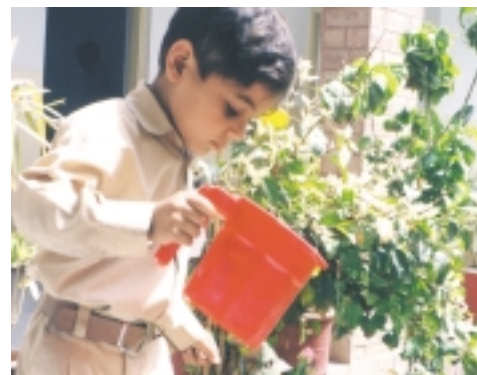
Sharing and Caring

With the aim of developing a spirit of giving and sharing, we have initiated the practice of assigning each class III child the responsibility to nurture a plant during the year.