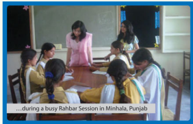
...during a busy Rahbar Session in Minhala, Punjab

In 2008 TCF successfully launched 'Rahbar', a completely volunteer-driven mentoring program. 'Rahbar' is aimed at the development of teenagers (studying in TCF secondary schools) to become responsible members of their communities. In June, this program completed its seventh successful cycle. It was held across 15 different campuses in Karachi, involved 600 students of grade VIII and 200 volunteer-mentors. This was the first time that Rahbar session was held in a TCF School – Dhoke Chaudhrian Campus in Rawalpindi. It involved 20 students and ten Rahbar mentors. In Lahore, the program was conducted in six campuses and involved 210 students and more than 50 mentors.