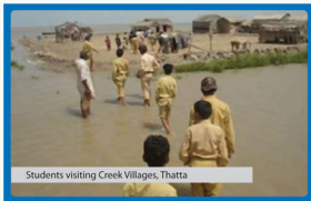
Students visiting Creek Villages, Thatta

World Wide Fund for Nature (WWF) has collaborated with TCF in Ketti Bandar area, Sindh to create awareness among students. From exposure visit to Creek villages of Thatta to Nature Study Camp at Keenjhar lake, TCF students have been involved in interesting field trips since last year. Over this period, students have been led to observe flora, fauna and plants and have been made aware of the environmental