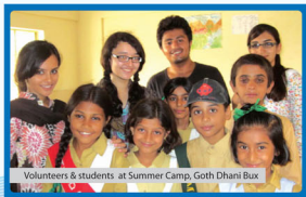
Volunteers & students at Summer Camp, Goth Dhani Bux

Summer Camp 2011 was conducted this month (4-22 July) simultaneously at multiple TCF schools in Karachi and Lahore and for the first time in Rawalpindi at Dhoke Chaudhrian Campus. 500 young, enthusiastic volunteers carried out different activities with more than 4,000 TCF students across 61 schools in these three cities. Prior to the camp, on June 24 and 25, a training and orientation program was conducted for the volunteers. These youngsters who led summer camps were from Pakistan's leading schools, colleges and universities who devoted five days a week for three weeks to carry out this program successfully.