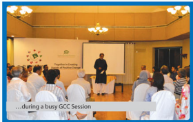
...during a busy GCC Session

The agenda of the conference included exploring TCF Vision, Mission statement, priorities as well as new developments within TCF. International chapters shared their accomplishments, strategies and challenges.