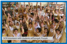
SCB Volunteers with students at Phengali, Punjab