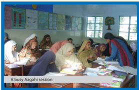
A busy Aagahi session

Aagahi is a collaborative Adult Literacy Program initiated by TCF & National Foods Limited (NFL). For the past seven years Aagahi is being conducted at various TCF campuses across Pakistan & selected TCF teachers specially trained to teach adults, have taught basic Mathematics & Urdu to 5,600 women to date. Partnered with Literate Pakistan Foundation, the main objective of Aagahi is to spread literacy among the mothers of TCF students. Aagahi's Ninth phase was conducted from February till May 2011. Around 81 centres were established in TCF schools and surrounding communities where 1,261 women successfully completed the program. In this phase, English alphabets and small English words were introduced for the first time in the curriculum.