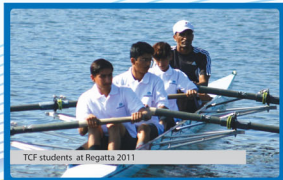
TCF students at Regatta 2011